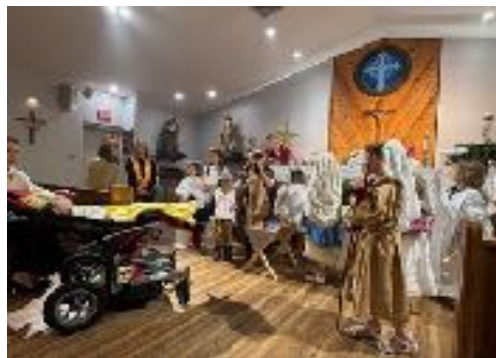
A SEAS prior Christmas Live Nativity