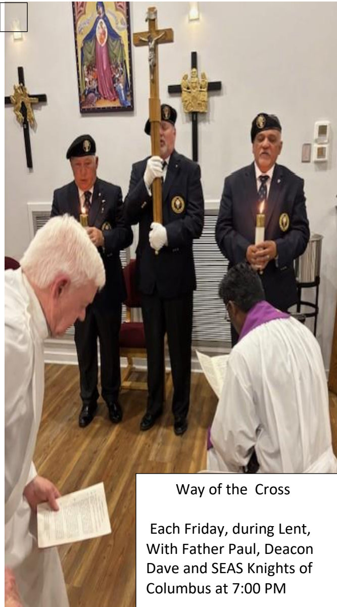
Way of the Cross

363-(At The Cross Her Station Keeping) /385-(Were You There)