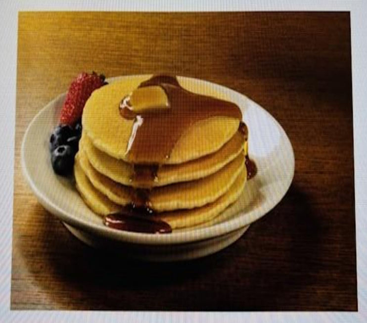
Cost is $5.00 for adults/$3.00 children under 10 Pay at the door.

Come for a delicious brunch featuring pancakes, sausage, eggs, biscuits and gravy, fruit, coffee and juice prepared by your SEAS Roundtable Knights.