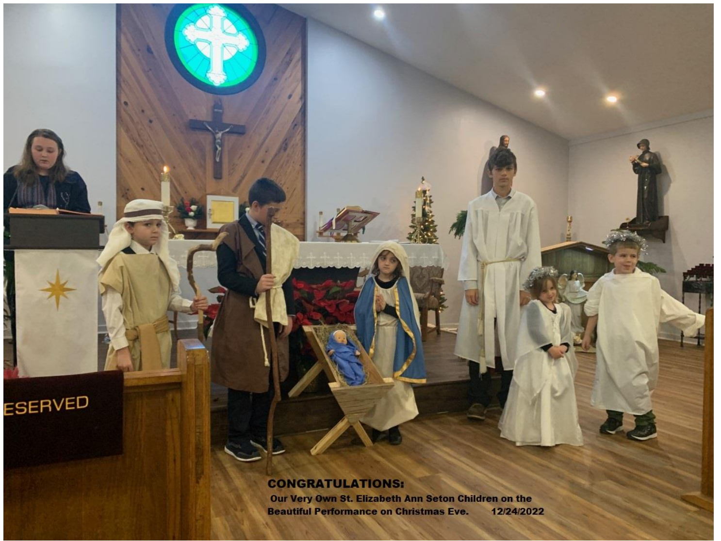
CONGRATULATIONS: Our Very Own St. Elizabeth Ann Seton Children on the Beautiful Performance on Christmas Eve. 12/24/2022

WELCOME to all new parishioners! If you have not registered, please fill out the following information. Once it's completed, you can simply detach and drop it in the collection basket, drop it off at the office during regular hours, or mail it in to us. You can also use this form to update your information or let us know that you are moving.