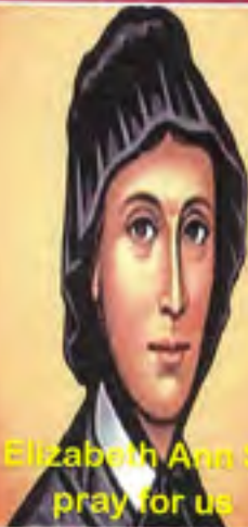
St. Elizabeth Ann Seton pray for us